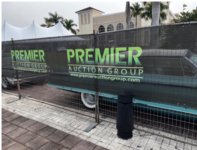
An old Cadillac, would love to have one of these.