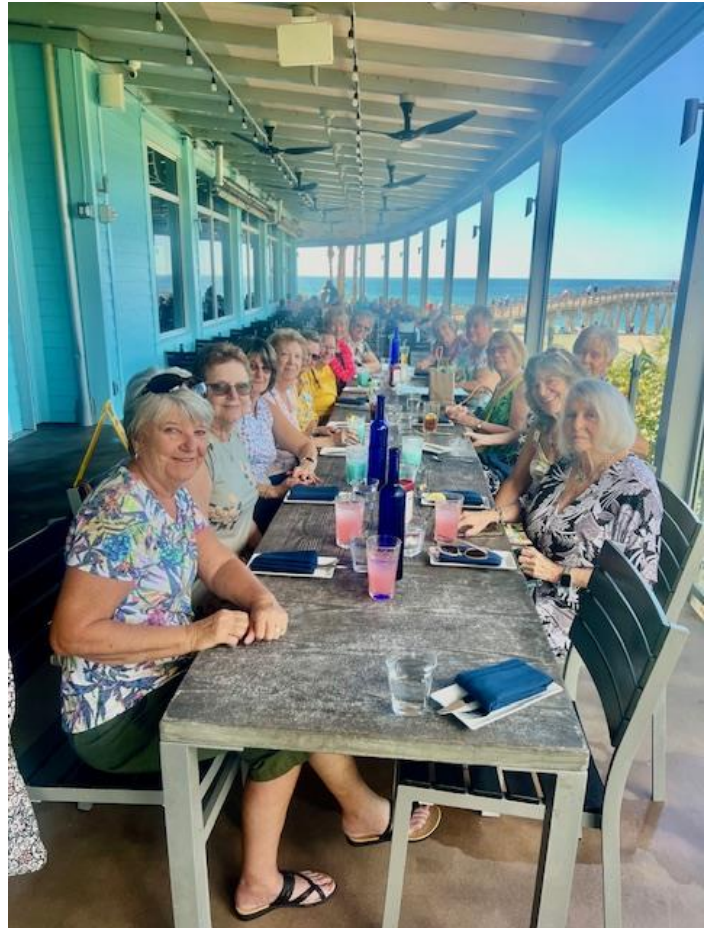
VFC Ladies at Fins on 11/9