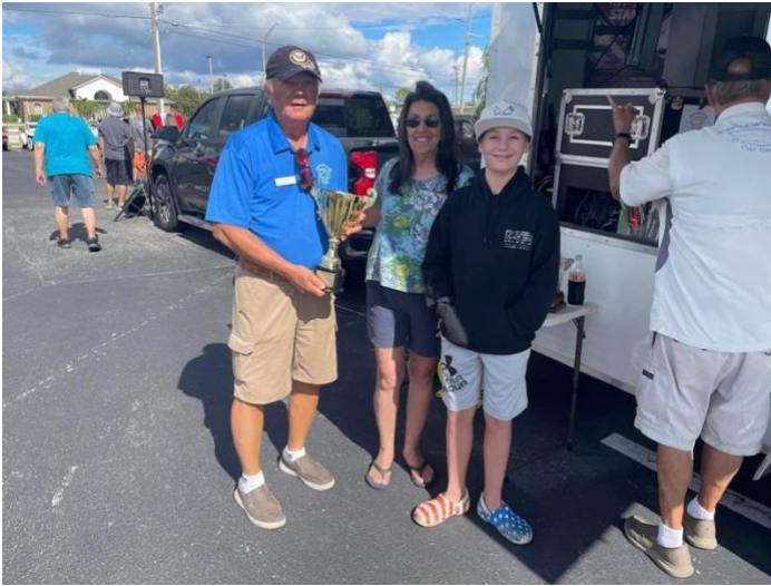
A wonder way to spend a Saturday, driving cars for auction in Punta Gorda.