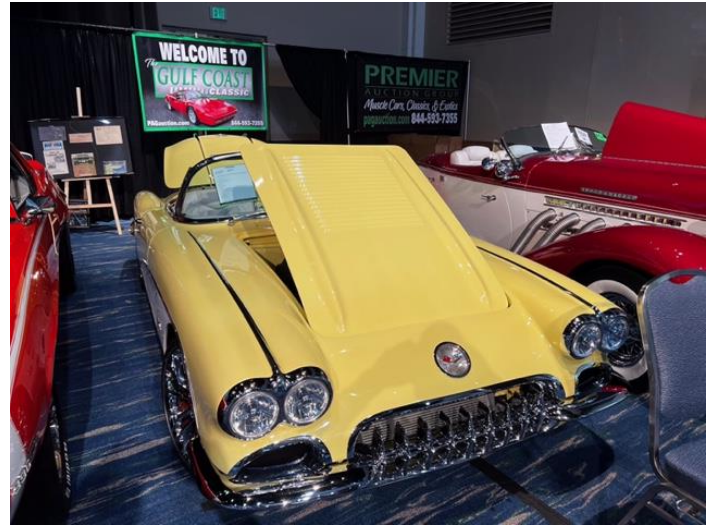
My first drive of the day, a 1950 Lincoln Cosmopolitan. I managed to flood it on the way out of the auction. How embarrassing.