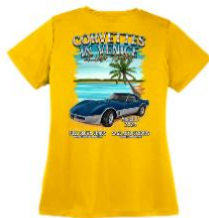
2024 Show Shirt