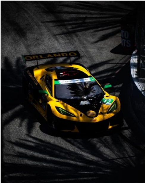
AWA Racing's Corvette Z06, car #13