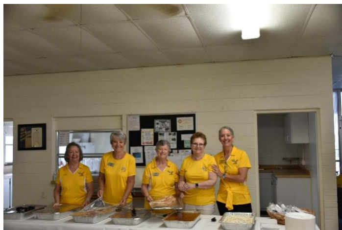
All set to serve!