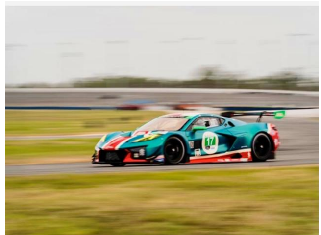
AWA Racing's Corvette Z06, car #17