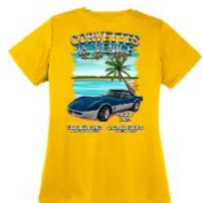
2024 Show Shirt